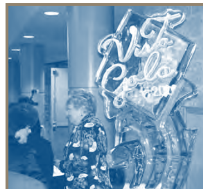
VisTaGala Ice Sculpture Created by Culinary Students