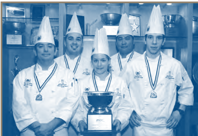
Schoolcraft College Award Winning 2009 Salon Team