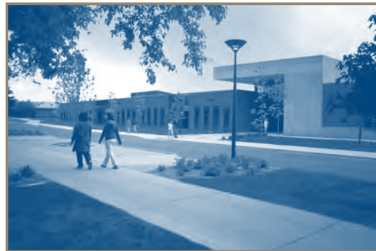
Biomedical Technology Center