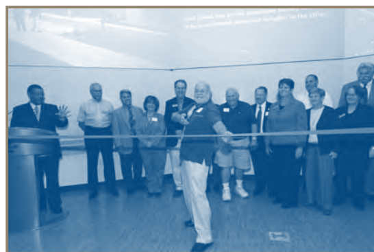
Biomedical Technology Center Grand Opening Reception on September 5, 2008

The Schoolcraft College Foundation wishes to thank all of our alumni, community leaders and donors for your generous gifts which enabled the Foundation to provide $1.5 million toward the Biomedical Technology Center's construction.