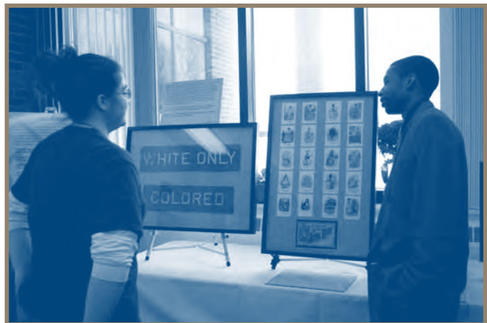
The “Jim Crow, Hateful Things” traveling exhibit