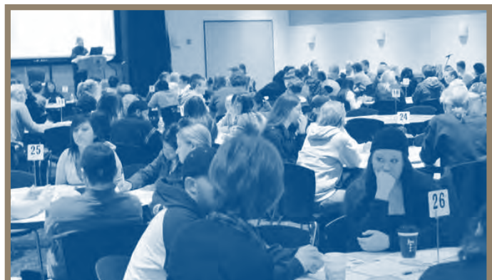
Schoolcraft students participate in Global Round Table Symposium on March 16, 2009