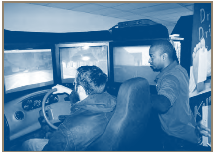
Schoolcraft student is driving the drunk driving simulator as part of the Save a Life Tour that was partially sponsored by a Schoolcraft College Foundation grant.

The Schoolcraft College Foundation Board of Governors makes grant awards in the spring of each year.