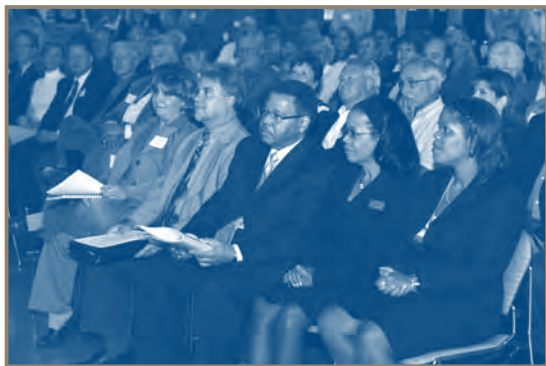
Biomedical Technology Center Grand Opening Reception on September 5, 2008

include an image analysis lab which is equipped with a scanning electron microscope. It is rare to have something like this at the community college level and it would not have been possible without the space provided by the new building."