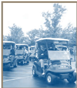
Golfers hit the links at Walnut Creek Country Club for the 2009 Golf Classic

ON MONDAY, JUNE 1ST, WALNUT CREEK COUNTRY CLUB WAS THE VENUE FOR THE FOUNDATION'S 26TH ANNUAL GOLF CLASSIC FORE SCHOLARSHIPS. WEATHER FORECASTS CALLED FOR RAIN – BUT OUR GOLFERS ENJOYED A BEAUTIFUL AFTERNOON OF NEARLY PERFECT GOLF WEATHER AS THEY COMPETED ON THE LINKS IN SUPPORT OF SCHOOLCRAFT COLLEGE STUDENTS.