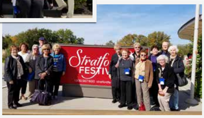
Group pose before Stratford performance.