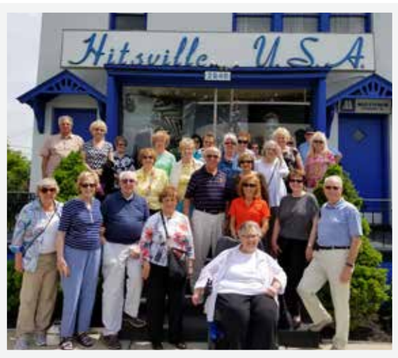
SC retirees enjoy the Hitsville stop.