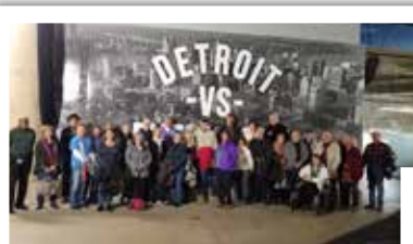
SC Retirees at Ford Field