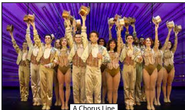
A Chorus Line