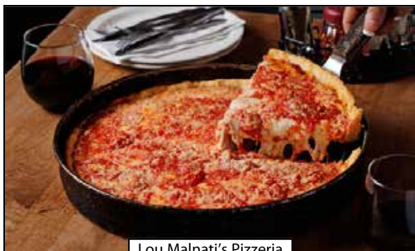
Lou Malnati's Pizzeria