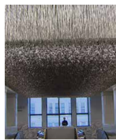
Above & Beyond Exhibit

Another highlight, was a tour of Chicago's historic Water Tower. The group was given a bird's eye view of the inner workings of this masterpiece of engineering that's been in operation since 1869. The last stop was a visit to Chicago's famous McCormick Place for shopping and lunch before making the journey home.