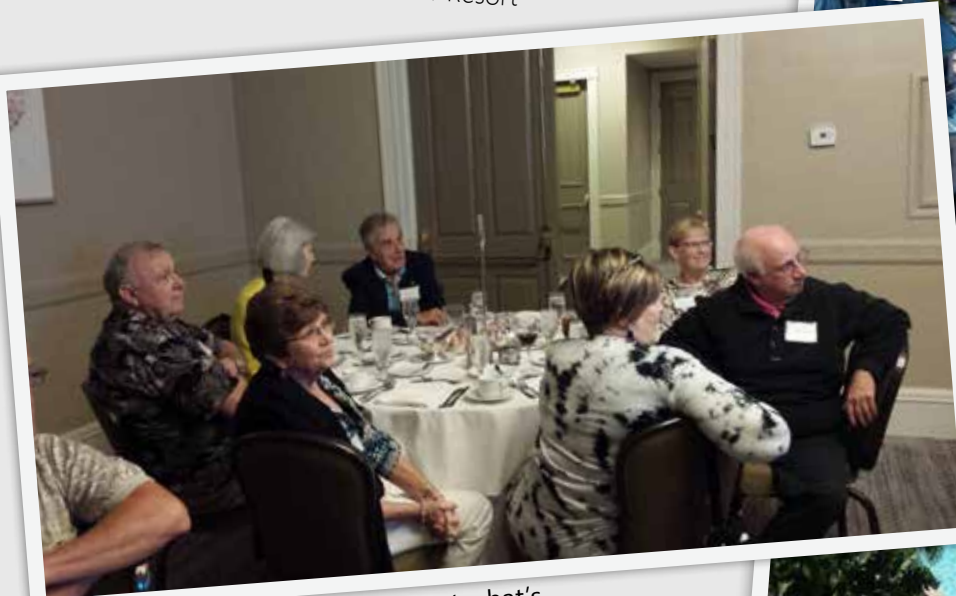
Guests enjoy a presentation about what's happening at the College.