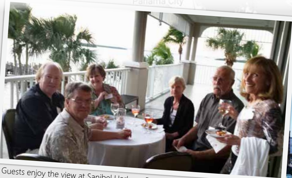
Guests enjoy the view at Sanibel Harbour Resort