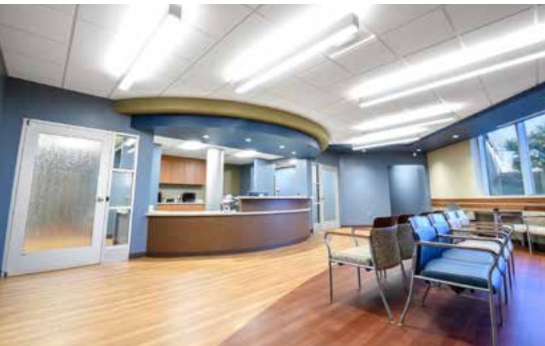
Waiting room at St. Joe's Urgent Care Center